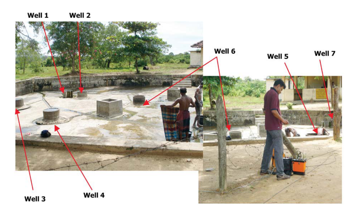
Figure 1: Well locations at Mahaoya thermal spring cluster